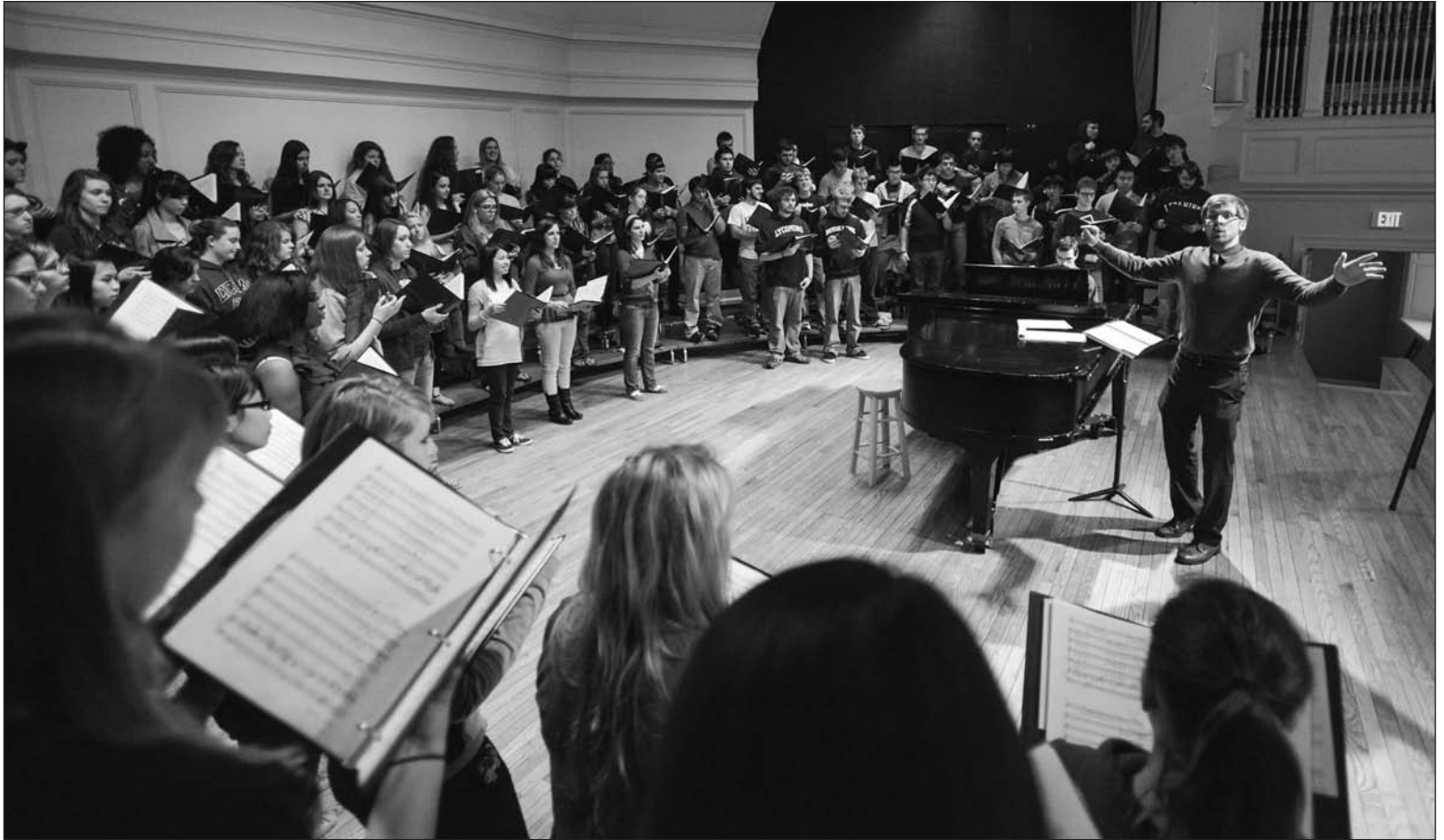
Lycoming College Choir during rehearsal