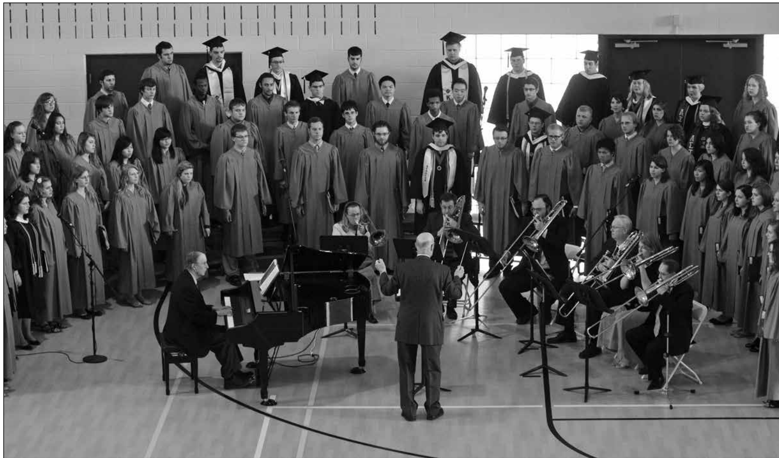
Lycoming College Choir during the 2012 Baccalaureate