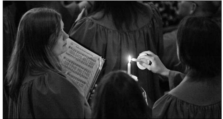
Lycoming College Candlelight Service 2009

Monday, March 1 ..... Providence United Methodist Church 7:30 pm Charlotte, NC Tuesday, March 2 ..... Hayes Barton United Methodist Church 7:00 pm Raleigh, NC Wednesday, March 3 ..... Jarvis Memorial United Methodist Church 7:00 pm Greenville, NC Thursday, March 4 ..... Ann Street United Methodist Church 7:00 pm Beaufort, NC Friday, March 5 ..... First Baptist Church 7:00 pm Hopewell, VA Wednesday, March 10 ..... Homecoming Concert, Clarke Chapel 8:00 pm Williamsport, PA