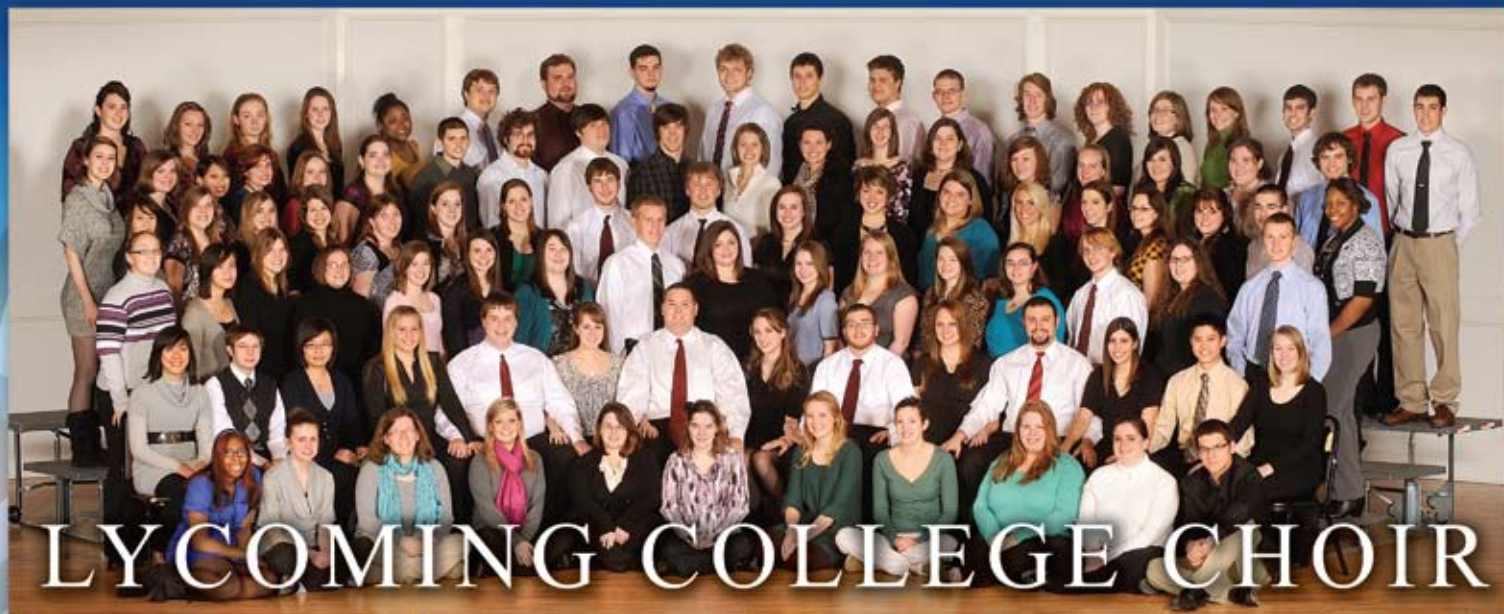
LYCOMING COLLEGE CHOIR